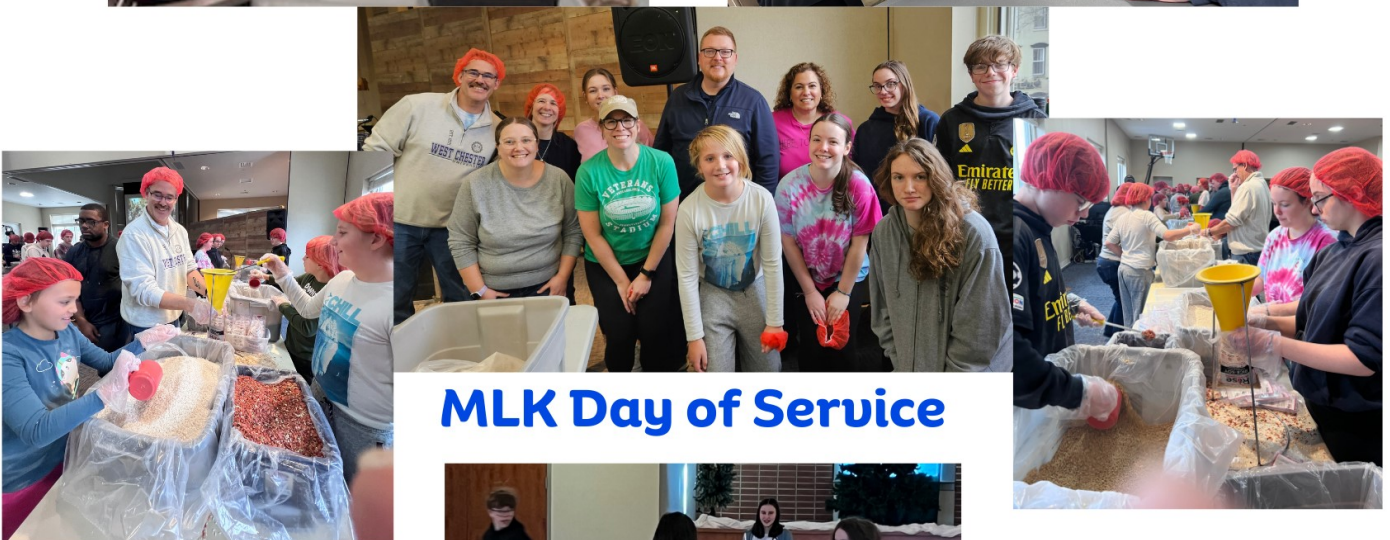
MLK Day of Service