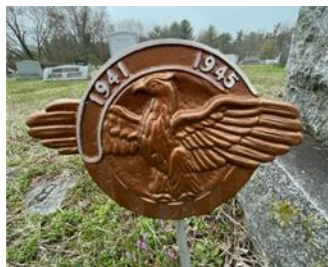
World War II