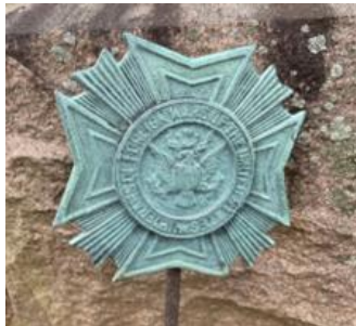
Veterans of Foreign Wars of the U.S.