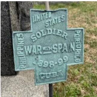
Spanish American War