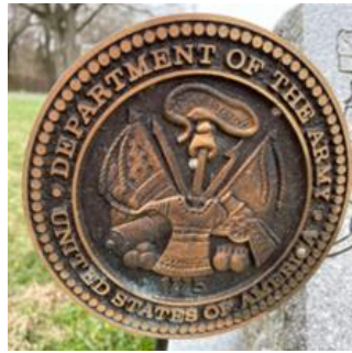
Dept. of the Army