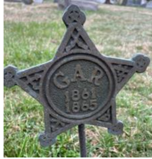
Civil War Grand Army of the Republic