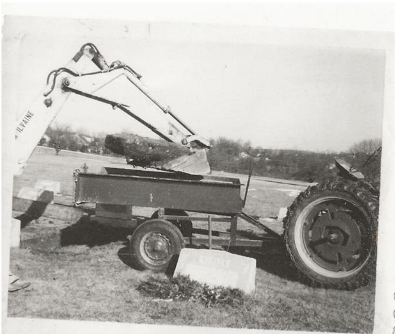
1950 Grave Digging Equipment