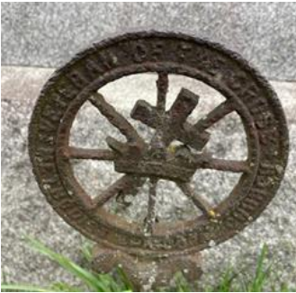
Methodist Veteran of the Cross