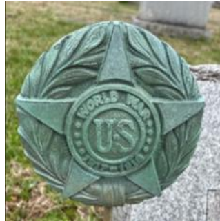
World War I